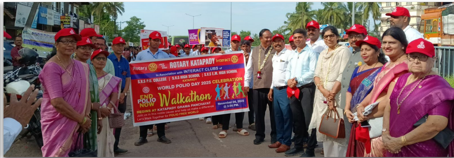
Inauguration of polio walkathon by DG and District Polio Coordinator