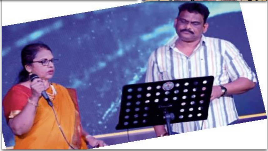
Actively participated in the Zonal Cultural and Sports Meets, winning several prizes.