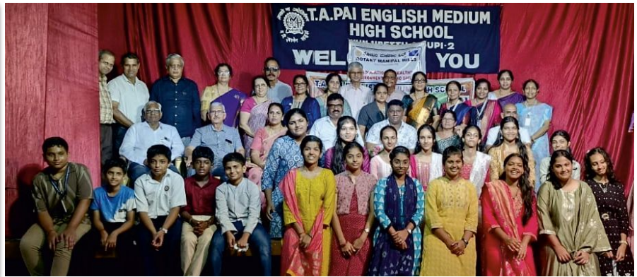
Celebrated Children's day at EMHS and distributed prizes and snacks to the children and staff