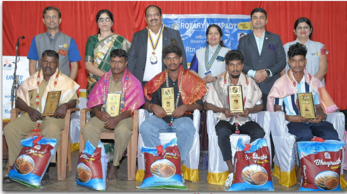
Honoured the cleaning staff for their dedicated service