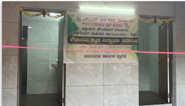
Donated Toilet block of worth Rs 12 Lakhs.