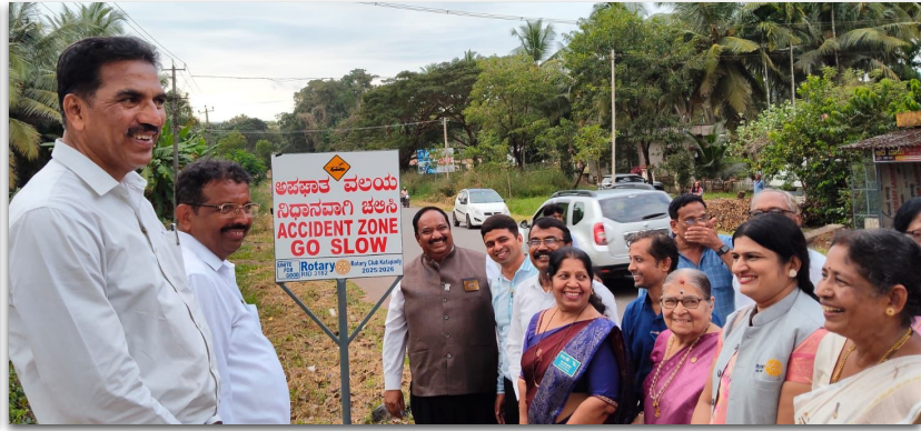
Inauguration of road safety sign board by District Governor