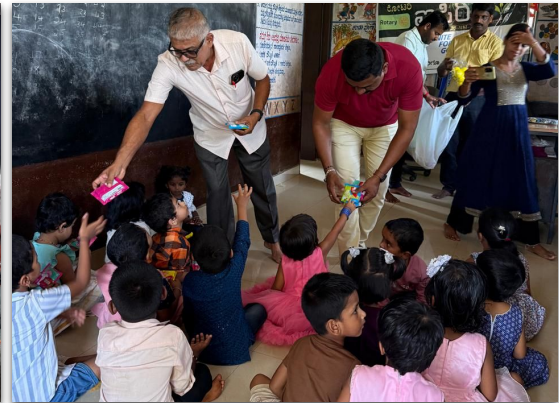
Distributed sweets and toys to 11 anganwadi schools on 14th November on the occasion of children's day