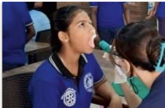
Conducted Dental checkup and Screening at Rajeev Nagar Composite high school. Rajeev Nagar, Manipal. More than 200 participated in this camp