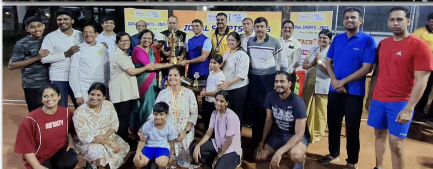
Participated in ZONAL SPORTS EVENT Zone 4 -ROTACROWN, held at Manipal and emerged as the Runner-up in Overall Championship