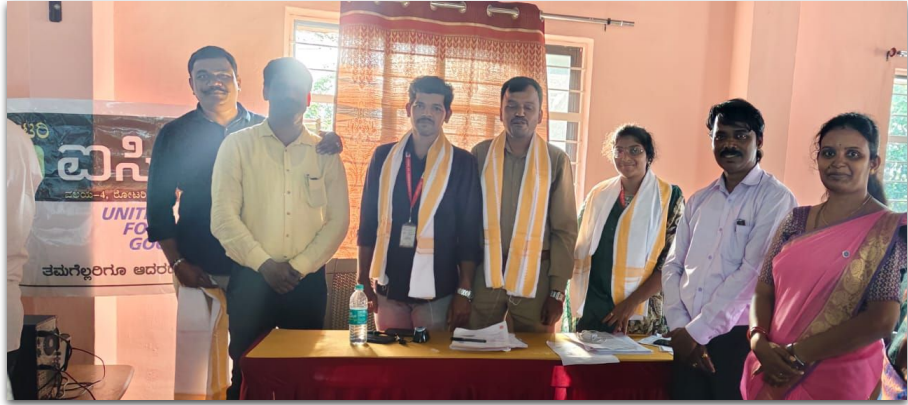
Felicitated postal staff