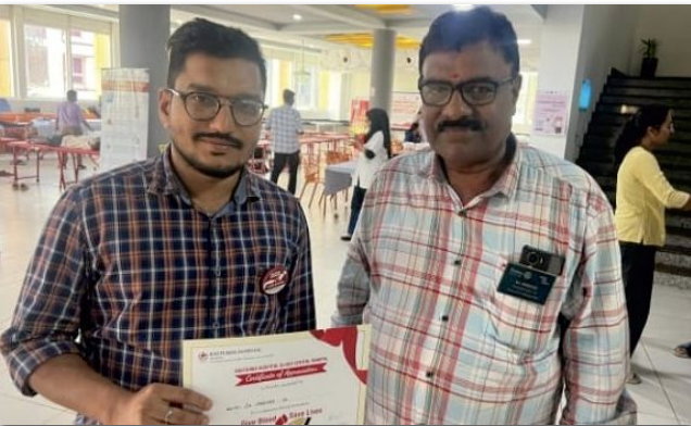
Organized Blood donation camp at MIT, Manipal