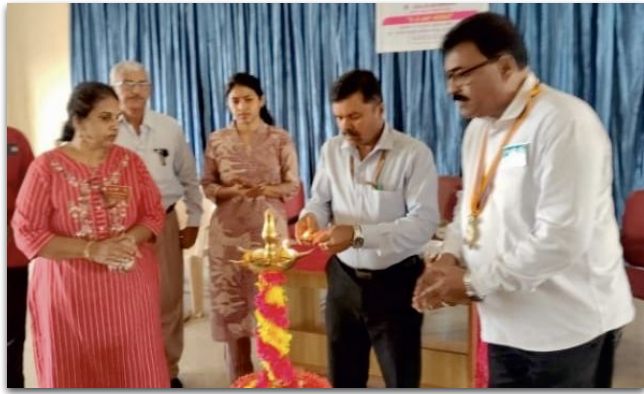
Organized CPR training at ITI Pragathi Nagara by the team of KMC MANIPAL